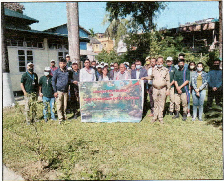
Pic-2: Group Photo