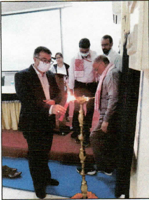
Pic-1: Inaugural Session

The Zoo Keeper's Training on Captive Management of Reptiles started on 1 st December, 2021 with the major objective of imparting training to the zoo keepers of Indian zoos with a special focus in the reptile section of the various Indian zoos. It aimed to emphasise the importance of Zoo keepers in the captive management of reptiles, as the Zoo keepers possess first-hand knowledge about animals, their health condition, behaviour, etc.